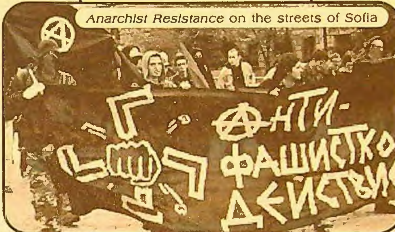
Anarchist Resistance on the streets of Sofia

On the 15th, a debate on the Face of Resistance from Anarchism to Antiglobalism took place. Members of the Anarchist Federation of Bulgaria, "BD Salonika 2003" and others took part.