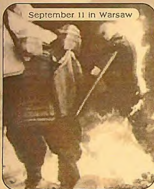
September 11 in Warsaw

In 2002 and 2003 number of open, especially workers' frictions in Poland has increased. Moreover, the employees have begun to organise the protests up and down the country. It goes without saying