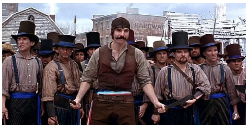
The movie Gangs of New York dramatized the violent nativist Bowery Boys

The First major gangs to develop in New York City was among ethnic whites, such as the Jewish Eastman Gang and the Irish Whyos. There were also "nativist" anti- immigration gangs such as the Bowery Boys.