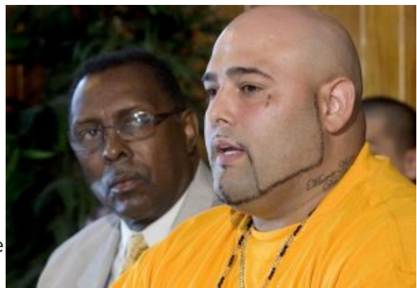
King J of NC ALKQN during 2008 call for inter-transition peace talks

The work being done by Cornell from 2008 to 2011 focused heavily on police accountability and reconciliation justice, culminating in a request for the federal Department of Justice to investigate misconduct within the force. As the gang unit was disbanded, some police personnel lost their jobs, bur more jobs were created under the commission of the Safe Streets Task Force, and more than $60,000 was awarded to that task force in a Greensboro City Council meeting that was held soon after the raid.