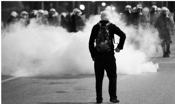
Greek comrades discovered left-wing tear gas is still tear gas July 2015

There is no concrete program of how we should go about doing this. There is no one-size-fits-all solution. It's not as simple as joining an organization or signing a petition. An autonomous and anti-hierarchical oppositional practice will take patience, experimentation, and a willingness to learn and be challenged on the part of each of us. There will be as many different practices of rebelling as there are rebels.