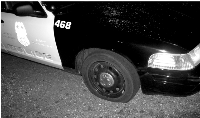
Tires punctured and windows smashed on MPD squad car. November 16th, 2015