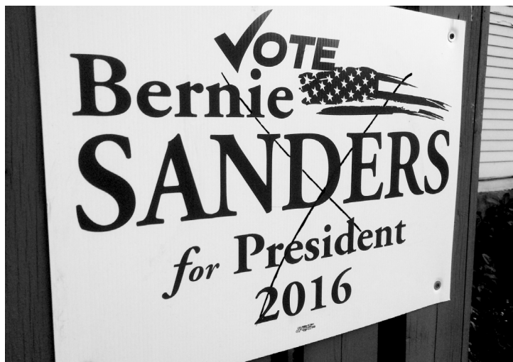
Crossed out Bernie Sanders sign near Powderhorn Park. June 2016

periodic crises of capitalism. In this context, arguing that positive social change will come through electing a president who will more generously distribute the spoils of this destruction among the citizens of a single country is naive at best and incredibly self-serving at worst, ignoring all the past, present and future suffering upon which this wealth is based.