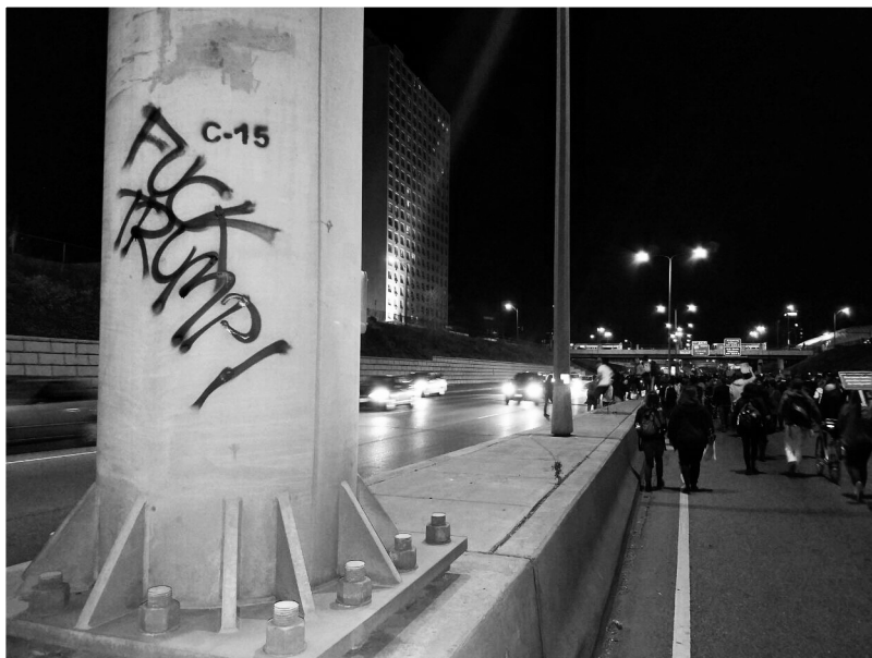
Graffiti painted as anti-Trump demonstration takes over the highway November 2016

It might be difficult to imagine anything meaningful produced in our current context from a handful of isolated acts of resistance, yet the world abounds with examples: gentrifying businesses closing in San Francisco after repeated vandalism, immigration enforcement raids aborted in London after spontaneous blockades, eviction lawyers in Berlin dropping cases after their cars are burned. These are small victories within western urban centers, but we have just as much to learn from the self-organized communities of southern Mexico, the squat-