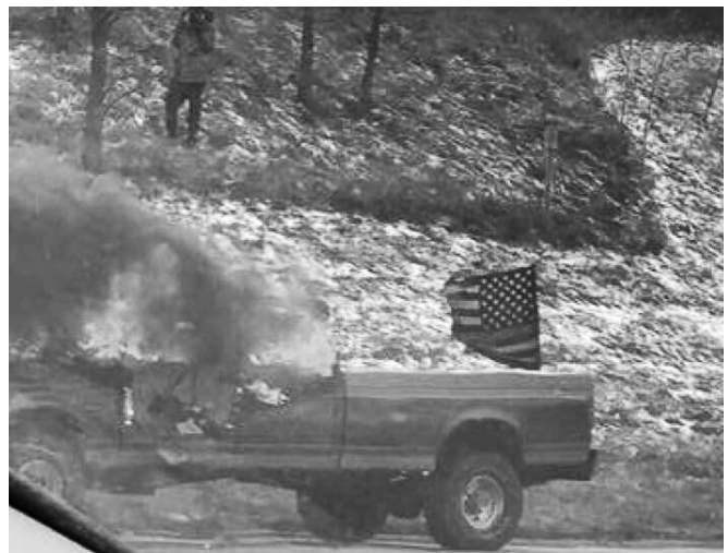
Burning vehicle displays "Blue Lives Matter" flag. November 2016