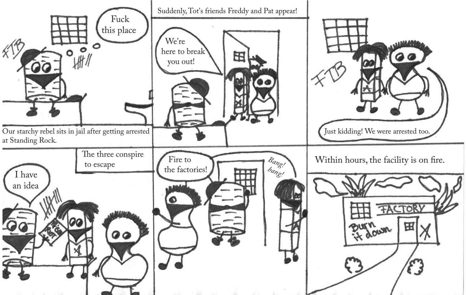
Our starchy rebel sits in jail after getting arrested at Standing Rock.