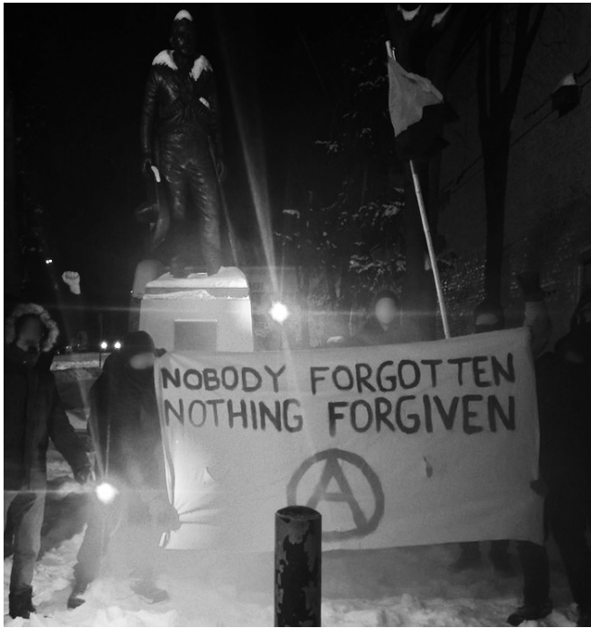
Memorial for fallen comrades December 2016