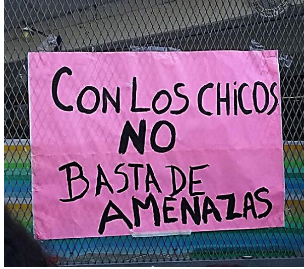
Not Against the kids. Stop threats.