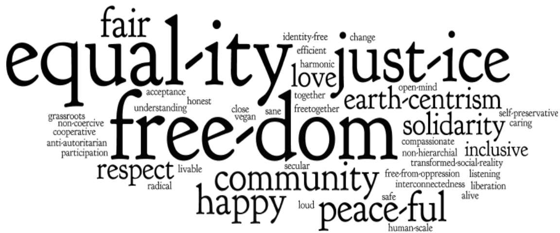
Illustration 1: In the survey, people were asked to give three words for how they envision their utopian world. Nouns and adjectives were combined, i.e. equal and equality to equal-ity. Size and strength represents frequency of mention.

UI offers a big array of benefits for activism and activists. It can bring people into activism, support optimism and positive thinking, motivate people to keep going, preventing burn-out and reducing turn-over rates. It can further help in de-constructing the social order, impact the construction of the material world, and point activists towards prefigurative politics. UI and give direction through focusing on what one wants and therefore help activists to align their actions with their visions and goals. Utopian Imagination can raise consciousness and awareness in a way that is more sustainable than the motivation based on rejection of present ills. This sustainability supports knowledge transfers and allows movements and groups to evolve, learn, and grow. UI can be beneficial for motivation, energy, and hope. It can strengthen desires and the belief that positive change is indeed possible. It can support creativity and thinking outside the box in terms of what is possible but also outside the toolbox of activism. This gives the chance for fighting against the worst present ills while making sure that strategies and tactics have the potential to go beyond resistance and build a future